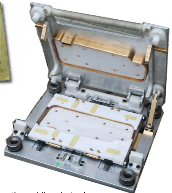
Automotive welding electrodes